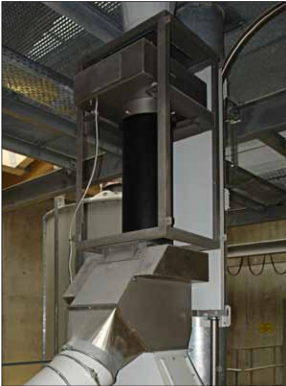
Metal separator RAPID DUAL used for machinery protection during wood pellet production