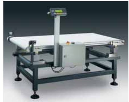
Weighing module WM60|WM120