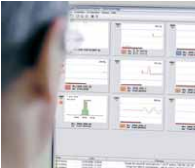
Data display directly from the process on your central screen

are new software packages that enable you to seamlessly control and manage any number of SYNUS® and | or CoSYNUS devices in network operation via a PC. The user interface and the ability to save and document data meet the highest specifications of both users and lawmakers. These software packages can be used individually or combined. Together, they represent a comprehensive solution for efficient time and cost-saving monitoring and control.