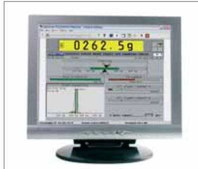
Sartorius ProControl@Remote user interface