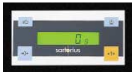
EA Economy for "Weighing"

This means you can weigh faster than ever before! Just place a sample on the scale, and you'll obtain the stable weight readout within approximately half a second. Now you can zip through your work at an unequalled pace.