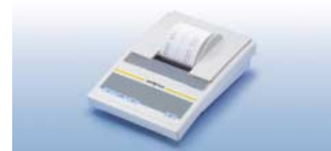
YDPO4 strip printer