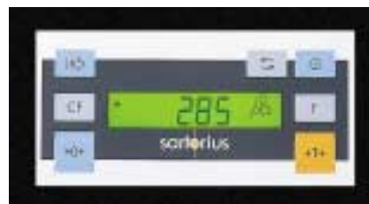
EB Economy "Weighing plus Application"